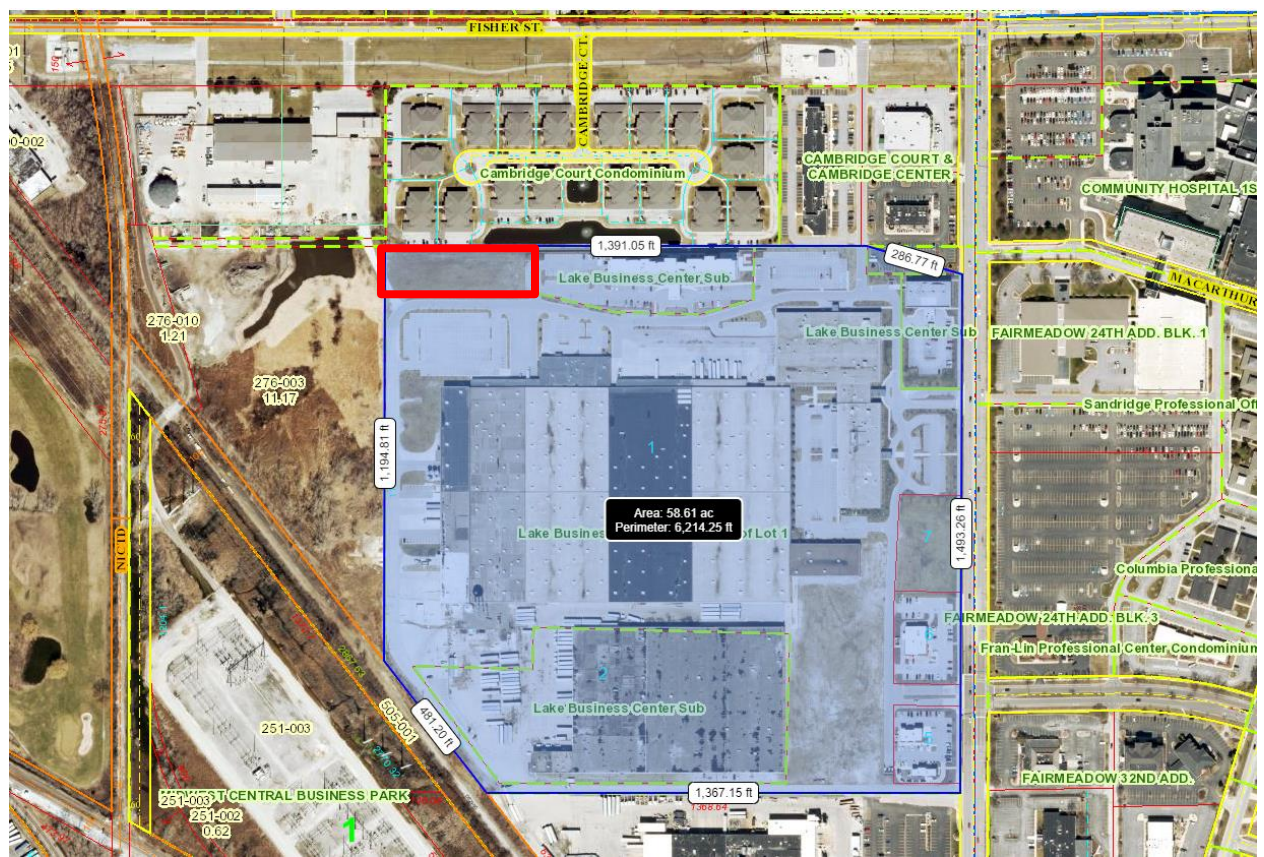
Figure 1: Lake Business Center PUD in blue. Subject property outlined in red.