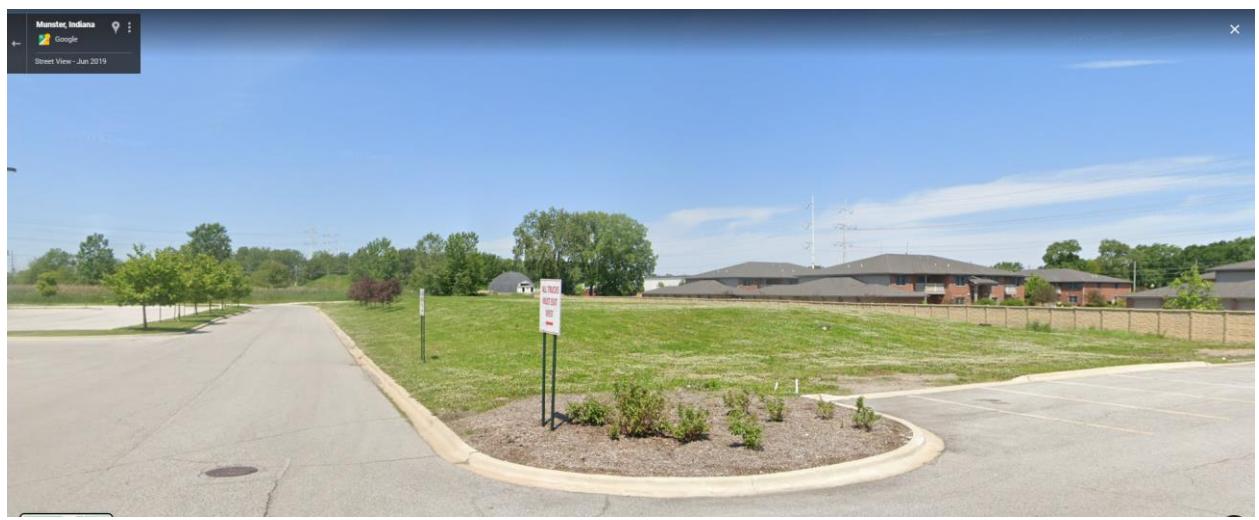
Figure 2: Google streetview of subject parcel

Hospitality Project Services, represented by Cripe Architects and Engineers, has presented plans to construct a four-story, 107 room Home2Suites with a 21-space parking lot at the northwest corner of the Lake Business Center PUD at 9200 Calumet Avenue. The Lake Business Center PUD is an approximately 56-acre parcel of land that includes multiple lots located along Calumet Avenue south of Fisher Street and north of the Pepsi Bottling plant. The PUD contains a mix of uses that includes professional offices, medical offices, restaurants, warehousing and manufacturing, and a 99-room hotel.