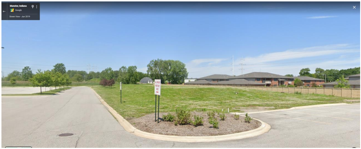
Figure 1: Google streetview of subject parcel

Hospitality Project Services, represented by Cripe Architects and Engineers, has presented plans to construct a four-story, 107 room Home2Suites with a 21-space parking lot at the northwest corner of the Lake Business Center PUD at 9200 Calumet Avenue. The Lake Business Center PUD is an approximately 56-acre parcel of land that includes multiple lots located along Calumet Avenue south of Fisher Street and north of the Pepsi Bottling plant. The PUD contains a mix of uses that includes professional offices, medical offices, restaurants, warehousing and manufacturing, and a 99-room hotel.