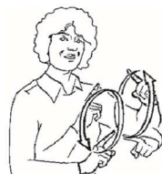
SIGN, SIGN LANGUAGE