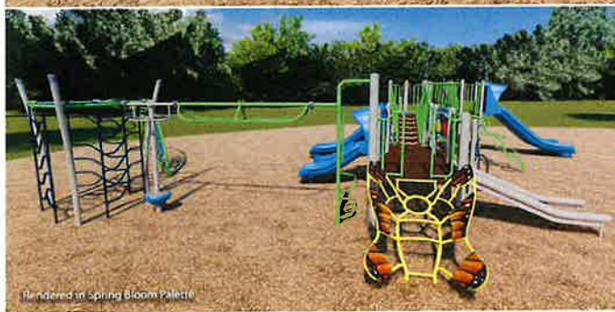
Rendered in Spring Bloom Palette